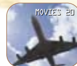
8-Character Channel Labeling